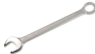
7/16" wrench (not included)

*NOTE: This Hex Key is used to tighten all the screws used in the assembly process.